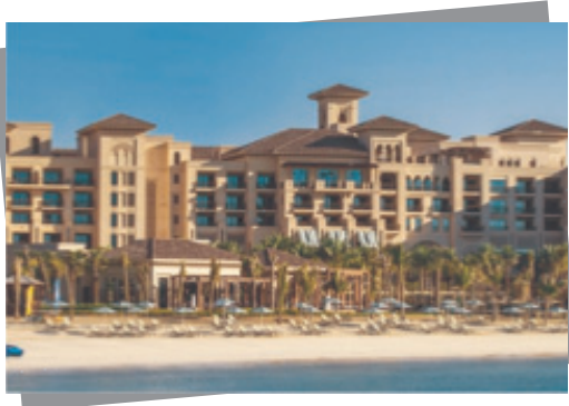
Four Seasons Hotel Dubai