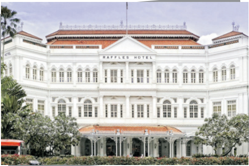
Raffles Hotel Singapore