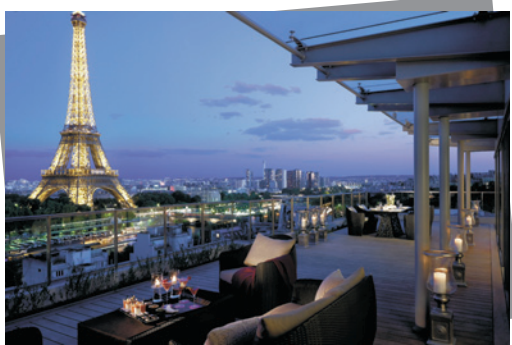
Shangri-la Hotel Parigi