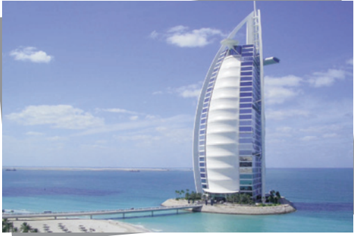
Burj Al Arab Jumeirah Dubai