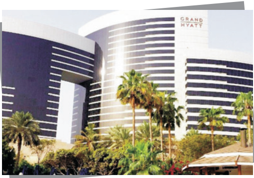
Fiorentina Grand Hyatt Hotel Tokyo