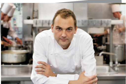
Daniel Humm Stati Uniti