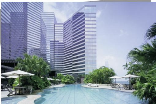
Grand Hyatt Hotel Hong Kong