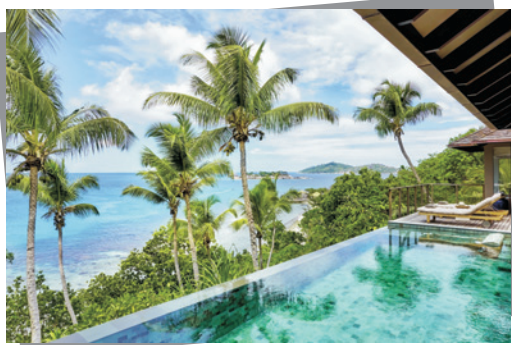
Six Senses Zil Pasyon Hotel & Resort Seychelles