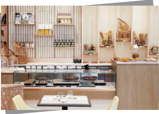
Mada One Restaurant Monte Carlo