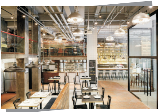
Popolo Restaurant Shanghai