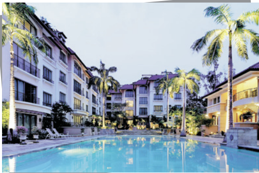
Shangri-La Hotel Singapore