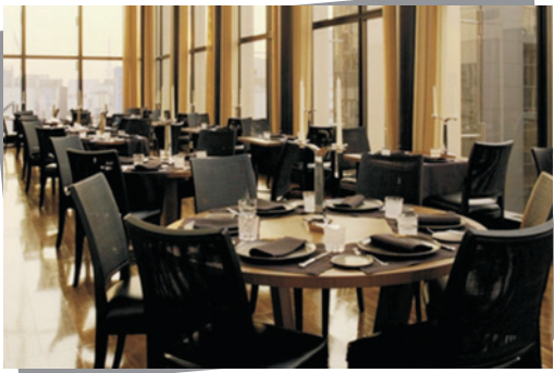
Bulgari Restaurant Tokyo