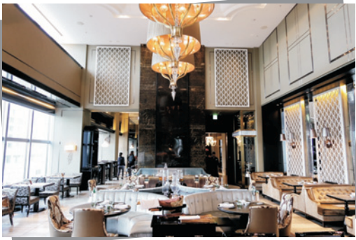
Piacere Shangrila Hotel Tokyo