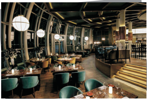
Monti Restaurant Lounge Singapore