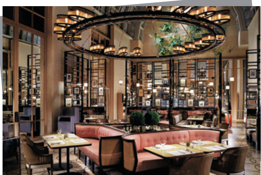
Colony Restaurant Ritz Carlton Millenia Singapore