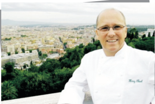
Heinz Beck Italia