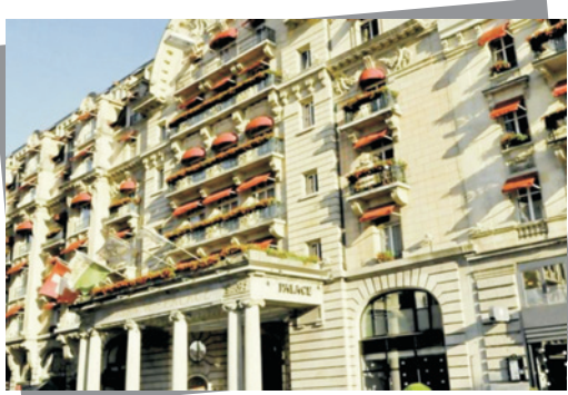
Losanna Palace Hotel Losanna