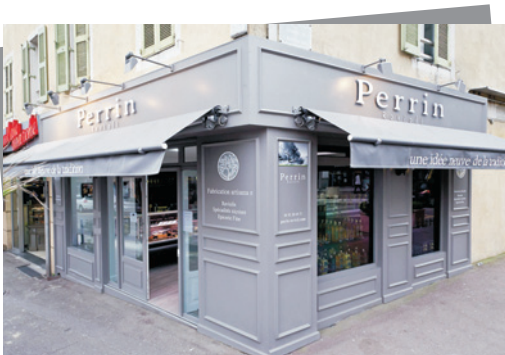
Perrin Food Shop Nizza