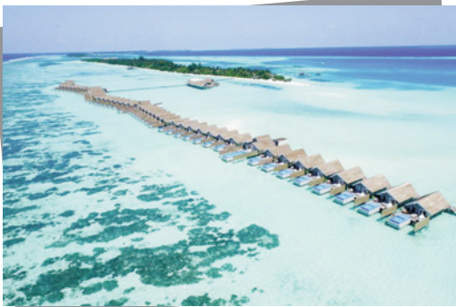
LUX* Hotel Maldiva