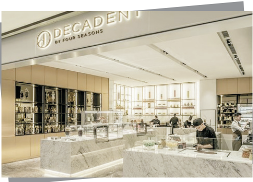
Decadent Food Shop Four Seasons Kuala Lumpur