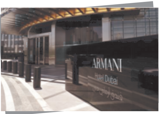
Armani Restaurant Dubai