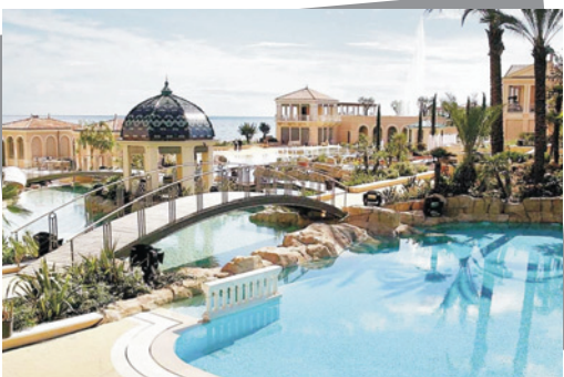
Monte Carlo Bay Hotel & Resort Monte Carlo