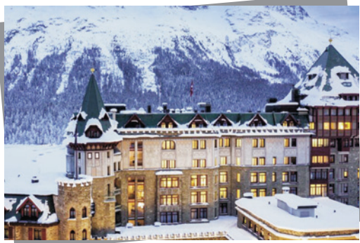
Badrutt's Palace Hotel Saint Moritz