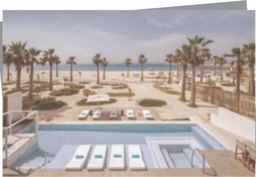
The Bay Restaurant Mandarin Oriental Dubai