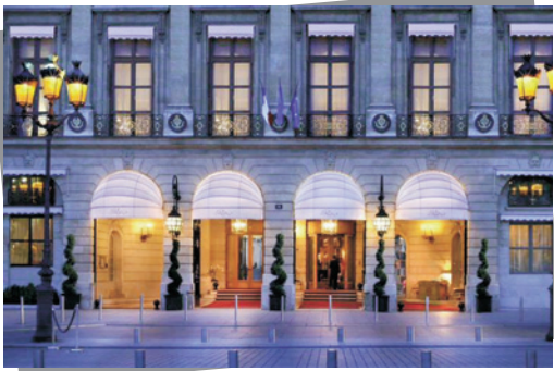
Ritz Hotel Parigi