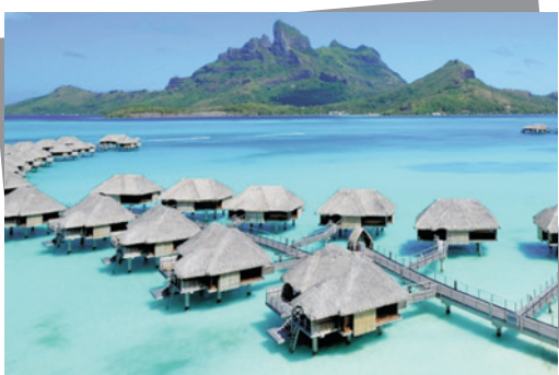
Four Seasons at Kuda Huraa Hotel Maldiv