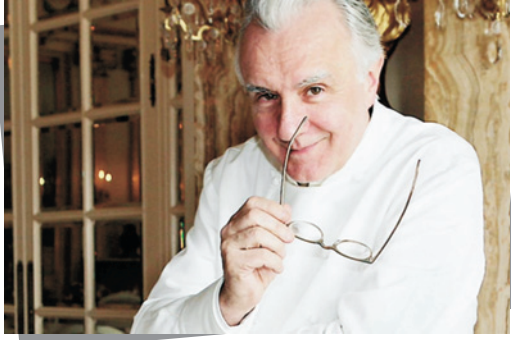
Alain Ducasse Francia