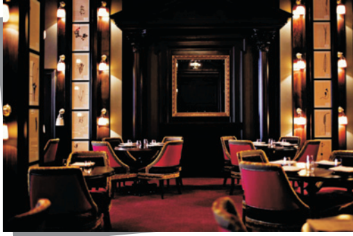
NoMad Hotel New York