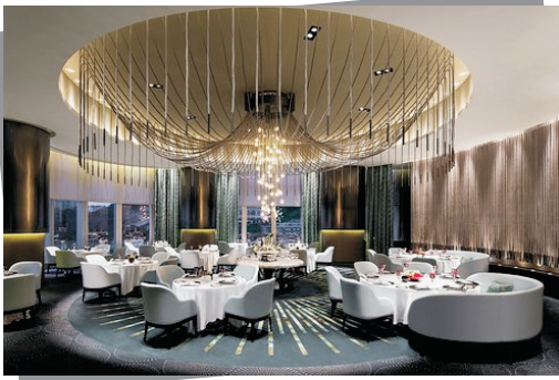
Tasting Room Restaurant Macao