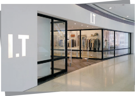
I.T. Fashion Store Hong Kong