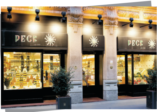
Peck Food Shop Milano