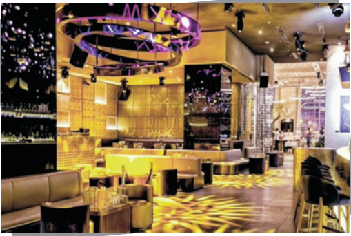
Billionaire Restaurant Dubai