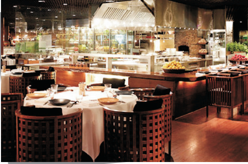
Mezzanine Grand Hyatt Restaurant Singapore