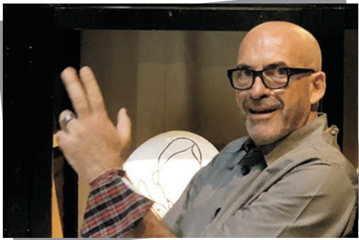
Antonio Marras Italia