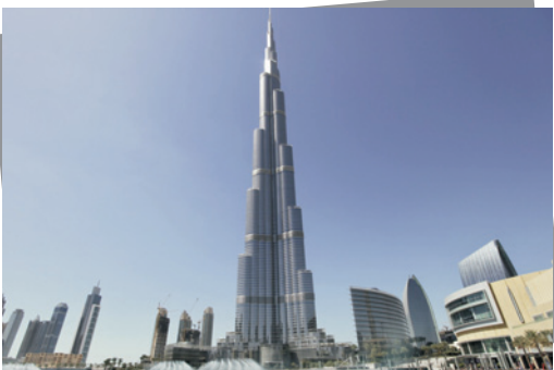
Burj Khalifa At.mosphere Dubai