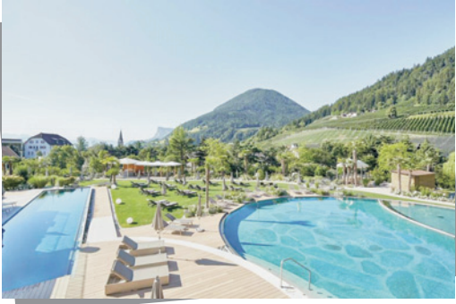
Marlena Hotel Resort Merano