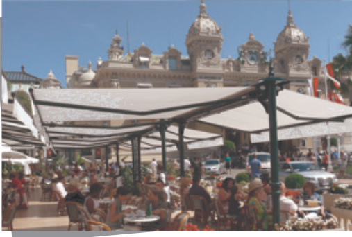
Cafè de Paris Restaurant Monte Carlo