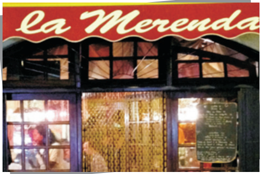
Merenda Restaurant Nizza