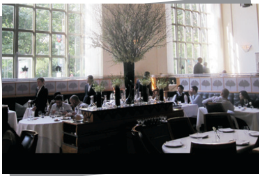
Eleven Madison Park Restaurant New York