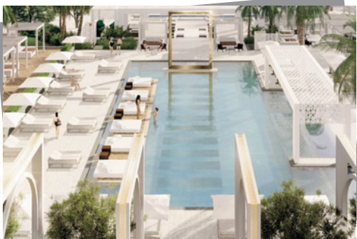
Royal Mirage Hotel Drift Beach Dubai