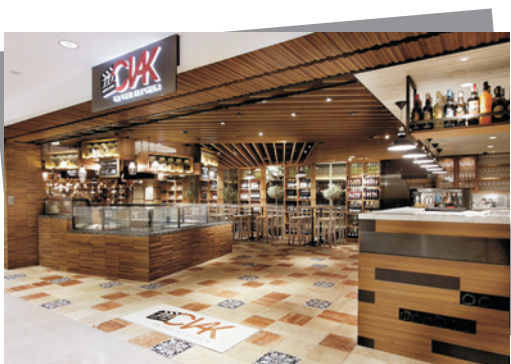
Bombana - Ciak Restaurant Hong Kong