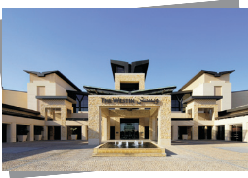
The Westin Hotel & Resort Abu Dhabi