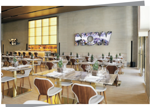
Art People Aishti Restaurant Beirut