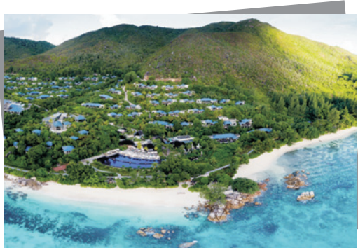
Raffles Hotel Seychelles