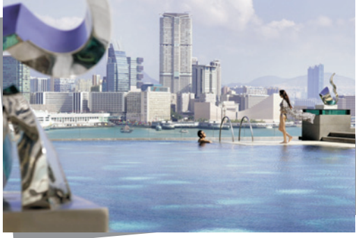
Four Seasons Hotel Hong Kong