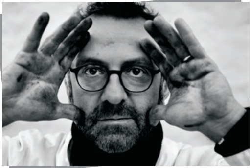
Massimo Bottura Italia