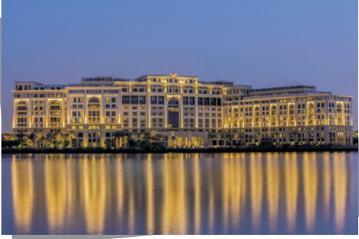
Palazzo Versace Hotel Dubai