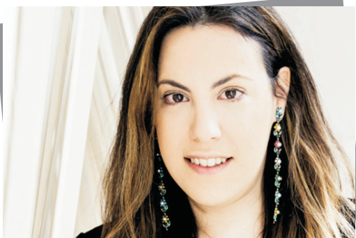
Mary Katrantzou Grecia