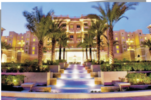
The Westin Dubai Mina Seyahi Resort Dubai