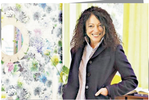
Tricia Guild Inghilterra