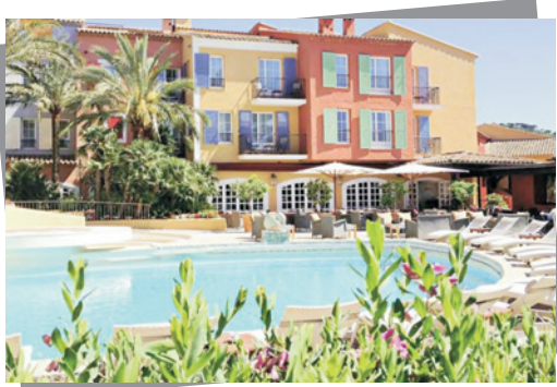
Byblos Hotel Saint Tropez