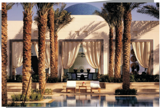
Park Hyatt Hotel Dubai