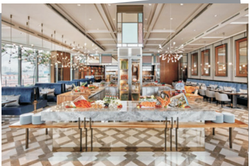
Racines Restaurant Sofitel Hotel Singapore