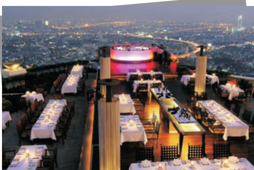
Lebua Hotel & Resort Bangkok