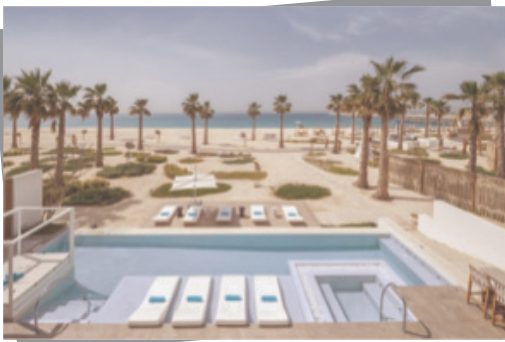
Nikki Beach Beach-Lounge Dubai