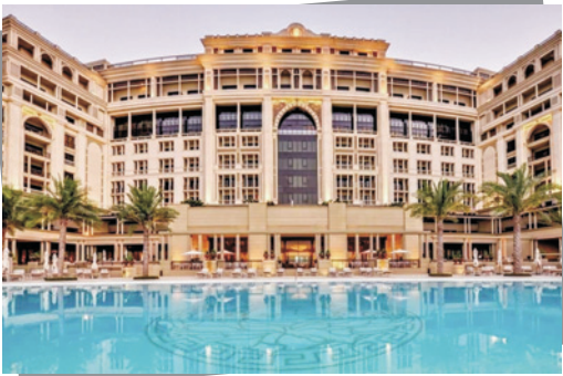
All Naseem Hotel Dubai