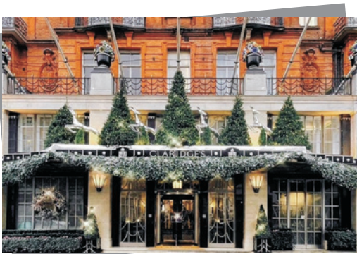
Claridges Hotel Londra