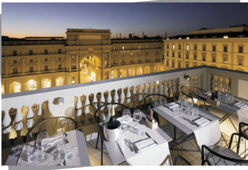
Toscanino Restaurant Firenze