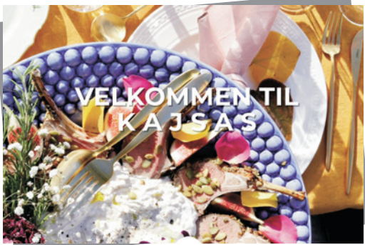
Kajasas Food Shop Oslo