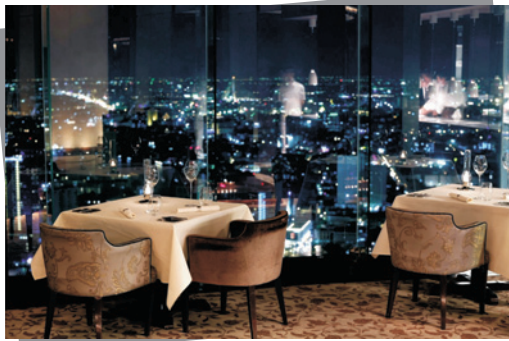
Mezzaluna Restaurant Bangkok