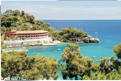
Monte Carlo Beach Hotel & Resort Monte Carlo