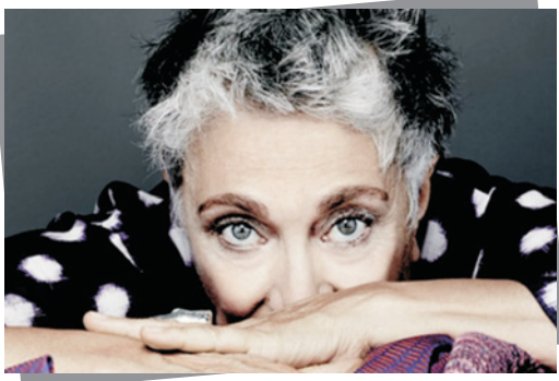
Paola Navone Italia